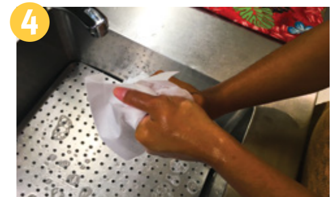
Step 4: Dry hands thoroughly with a paper towel.