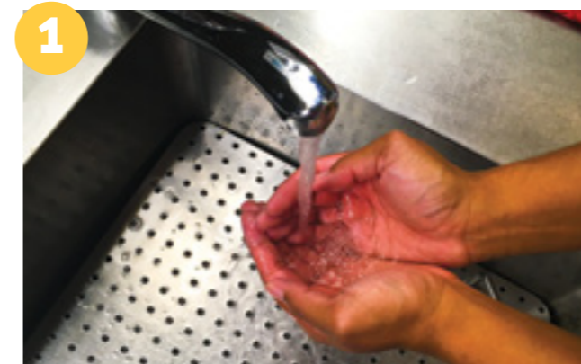
Step 1: Wet hands with water and cover with soap.