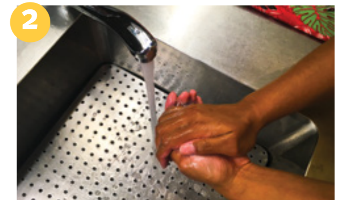
Step 2: Rub hands and interlock fingers together for a thorough clean.