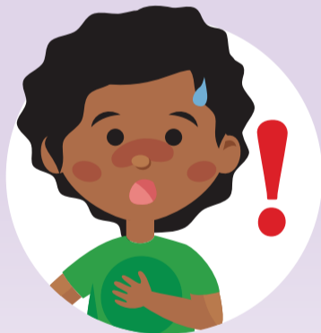
Working hard to breathe