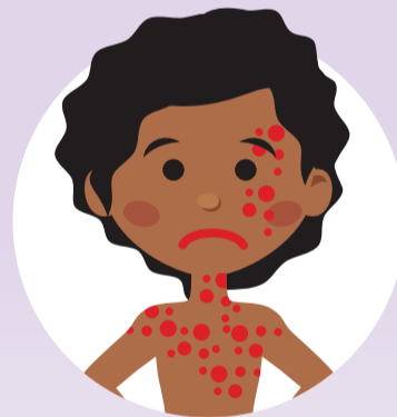
Rash that doesn't fade when pressed