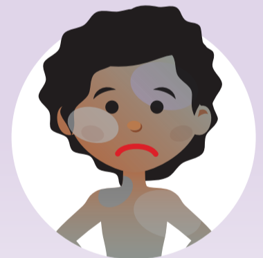
Blotchy, blue or pale skin