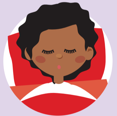
Drowsy or confused